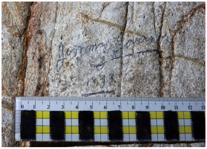
Jimmy Governor signature in Main Cave Timor - July 2020

So, what drove Jimmy and his two accomplices to become bushrangers/outlaws and what did they do during their reign of terror to have their names recorded in Australia's history? What historic evidence can be found to substantiate authenticity of Jimmy's signature? To set the scene let's look at Jimmy's life and whether he was in the Timor area during the year inscribed alongside his signature.